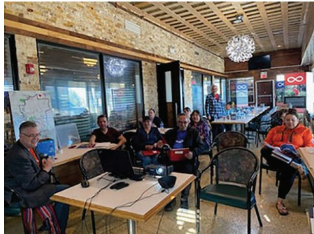
Figure 1: MNA Region 5 Métis Rights and Consultation Engagement Wabasca Local

During the of Métis Rights and Consultation engagement sessions we held in May 2022, we presented a revised, 11-question survey. In the results, the community told us the most important issue was hunting, trapping, and fishing (37). The second was Health and Wellness benefits (29) and the third was Métis Housing programs (28). It's distinctly clear in this informal survey and the stories over the past 2 years that Métis Citizens of this region value the lands, the water, the animals, and the fish. Our people continue to live a traditional Métis lifestyle as much as their ancestors had done.