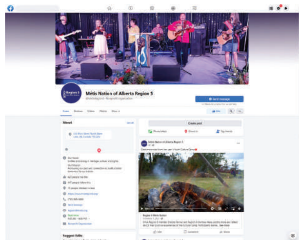
Métis Region 5 Facebook Page

Our new website ( https://www.mnaregion5.org/ ) is on the internet. Take a few minutes to look it over! There's lots of great information. You can also find recent updates on our Facebook page ( https://www.facebook.com/MétisRegion5/ ). Be sure to Like and Follow our Facebook page to see all the updates.